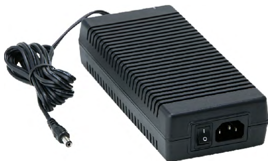
3.52"W x 7.44"L x 1.79"H