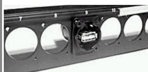
Unloaded 1 RU EH Rack Panel

Note: All panels come with cable tie bar