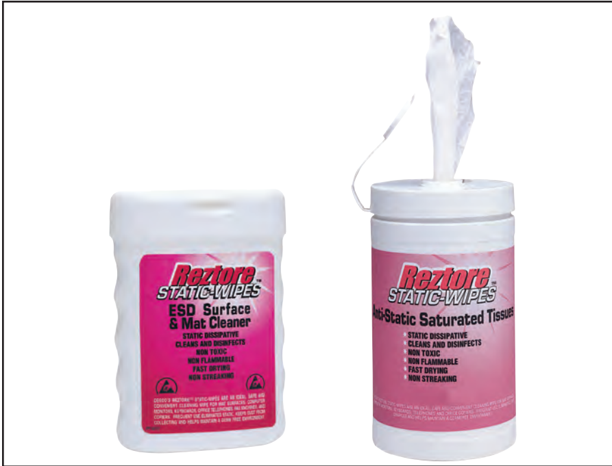
Figure 1. Reztore™ Static-Wipes: 60 Wipes in an Anti-Static Canister 160 Wipes in an Anti-Static Canister