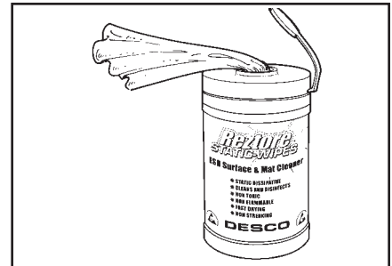
Figure 2. When separating a tissue, tear at an angle.

Lift the container cover from the canister and remove the seal from the lip of the container. Locate the first wipe in the center of the roll of wipes. Feed and push the first wipe through the hole in the center of the top cover and firmly re-attach the cover to the canister.