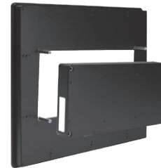
▲ Modulated design