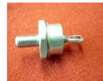
1N4510 Standard Rectifier (trr More Than 500ns)