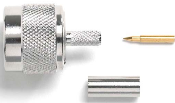
Model 73050 N Type Plug, 50 Ohm, Crimp Type, RG58, 141