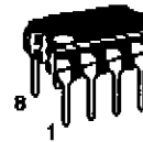
N SUFFIX PLASTIC PACKAGE CASE 626