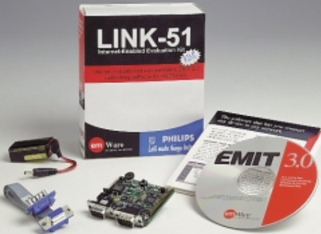
LINK-51 Evaluation Kit