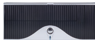
Power button with LED

300 W Power Supply One 6 cm fan and a reserved space for the second fan